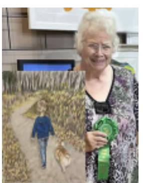
Honorable Mention Patsy Renz Color Pencil Painting "Let's Explore"