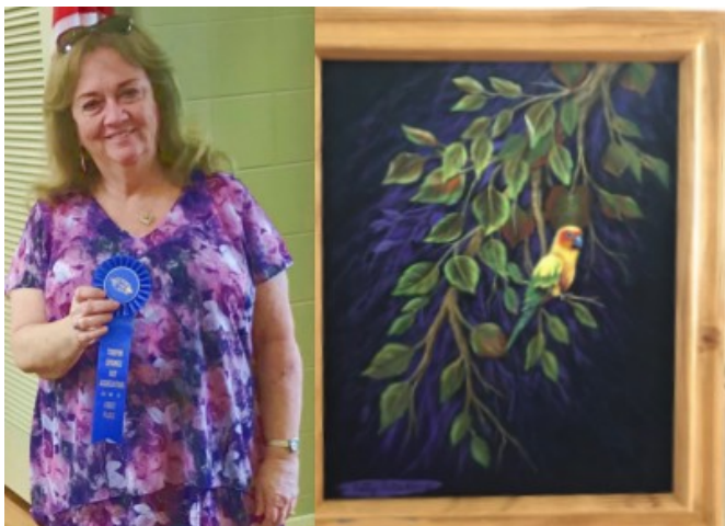
1st Place - Betty Stallard's Acrylic painting "Yellow Parrot"

Skillfully done, not overbearing with detail. Excellent flow inward. Great complimentary colors and contrast.