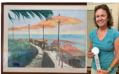
3rd Place - Ruth Smith's Water Color "The Reservation"

Great palette with a variety of complimentary colors. Eye drawn down road to a sunnier spot, a bit of anticipation.