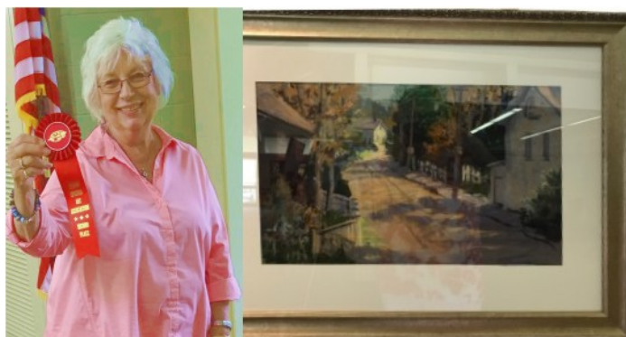
2nd Place - Carole Loiacono's water color "New England Street"

Skillfully done, not overbearing with detail. Excellent flow inward. Great complimentary colors and contrast.