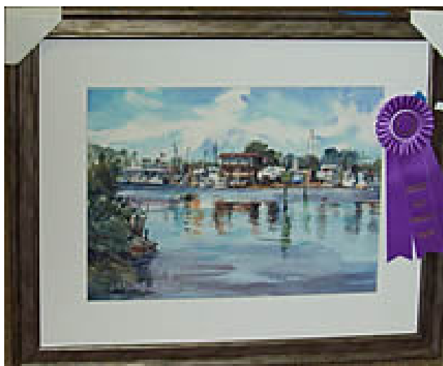
Best of Show Judy Rodgers